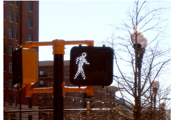
Countdown pedestrian signal

Priority bond funding funds the current match requirements for federal and state funds. The $8.9 Million in bond leverages over $47 Million in outside revenue for ongoing Transportation projects.