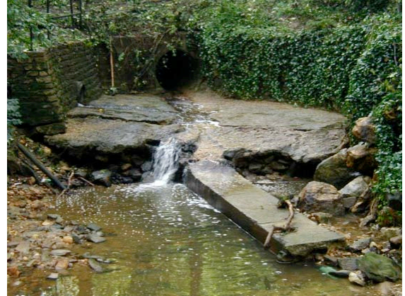
Stream restoration - before

The goal of this program is to maintain and improve the County's storm drainage system to minimize localized flooding in and from the public right-of-way, minimize soil erosion, and increase storm water capacity where needed. A major focus of this program is maintaining the infrastructure already in place as well as the construction of projects that minimize private property damage caused by flooding in the public right-of-way. In addition, environmental quality projects install treatment systems to reduce pollution from storm water runoff.