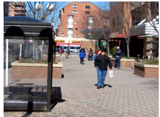
WALKArlington: more than just sidewalks.

The goal of these projects is to ensure that they are implemented consistent with the principles established through the WALKArlington report and the Pedestrian Transportation Plan. By placing a strong emphasis on non-automobile modes of transportation, construction of incremental elements that form and shape the pedestrian environment will be combined to create a truly world-class pedestrian experience.