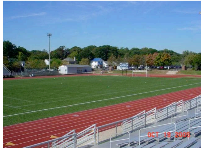
New Synthetic Field

The project goal is to convert at least one athletic field per year from natural grass to synthetic grass. This program will augment the installation of new synthetic fields as part of new park projects and renovations occurring throughout the County, such as North Tract.