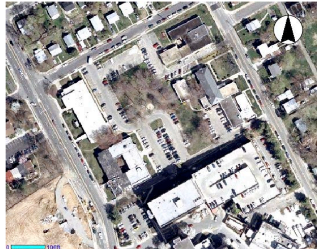
Aerial of site

Of the four primary facilities at the Edison Complex, three have a number of problems directly related to the age of the buildings. The George Mason Center was recently renovated for use by Head Start. The other 3 buildings are in great need for renovation or replacement. The eventual proposal is to removal of one or more of the existing buildings as well as the parking area. The demolition of existing buildings would allow sufficient area for the County to create a new facility with underground parking and of some height for office and program space. Right-sizing the program and office space will improve DHS's services to the public.