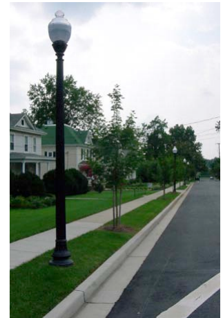
New Street Lighting, Sidewalk, Curb and Gutter

Supplemental funding totaling $5.9 Million would provide $1.5 Million to fund additional costs for previously identified projects, free up $1.0 Million for staffing the master plan study and $3.4 Million for new projects that were anticipated at original funding levels. In addition, the FY2007 proposed PAYG budget includes $500,000 in Tier I for Neighborhood Conservation.