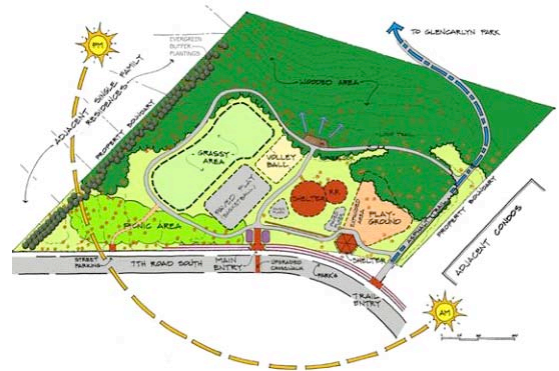
Schematic of site

Phase I of the three-phase Tyrol Hill Park Master Plan is being funded by the Neighborhood Conservation (NC) Program, and is scheduled for completion by the end of 2006. Phase III of the master plan is also being funded through NC, and is scheduled for completion in late summer 2007.